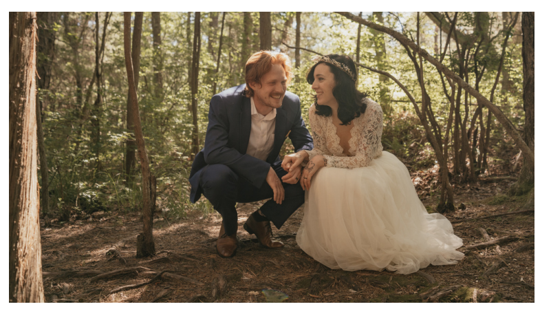
Congratulations on your engagement! We know this is an exciting time for you, your partner, your friends, and your families. Woodford Cedar Run Wildlife Refuge (Cedar Run) would be delighted to serve as the venue for both your ceremony and reception, or simply as the perfect location for your ceremony.

Our team will be there to assist you on your special day. With our facility being so customizable from vendors to catering and décor, everything can be tailored to suit your preferences.