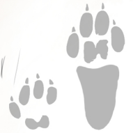
Front and Rear Tracks