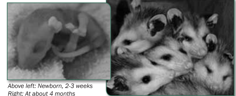
Above left: Newborn, 2-3 weeks Right: At about 4 months

Most of the orphaned opossums that come in to the Wildlife Hospital are found still clinging to their mother on the side of the road, after she has lost her life as a result of being hit by a vehicle. We see them in a range of sizes; some are just too small for us to help. However, with the help of a dedicated volunteer/opossum surrogate mother, we found a new formula from the National Opossum Society that works well for some of the tinier babies that come in. The smallest we successfully raised this year were only 14 grams. At this weight they were already two to three weeks old.