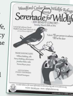
2011 Serenade for Wildlife Poster

Please call for tickets or info: 856.983.3329 X100.